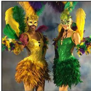
Mardi Gras Revelers